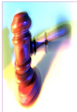
“Passing of the Gavel”