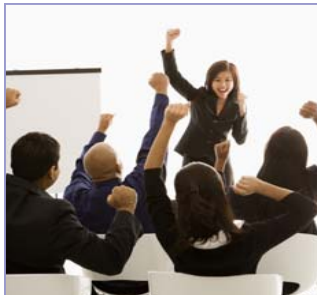
Get involved with an organization that will address your specific needs!

During the 66 year history of IAAP, office professionals have recognized the value of membership in an organization that addresses their specific needs in the areas of: