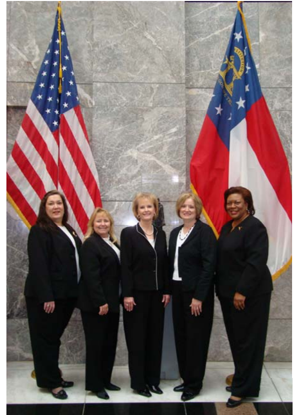
2009-2010 Georgia Division Board of Directors