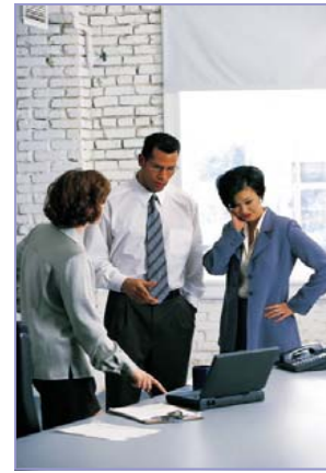
IAAP provides resources to meet needs and challenges facing administrative staff, today and tomorrow.

IAAP can become your partner in leading your administrative professionals toward achieving excellence. We provide resources to meet the needs and challenges facing the administrative staff, today and tomorrow. IAAP members receive the tools and knowledge necessary to become more effective contributors to their employers. By reading IAAP publications and attending IAAP educational events, members stay on top of their profession.