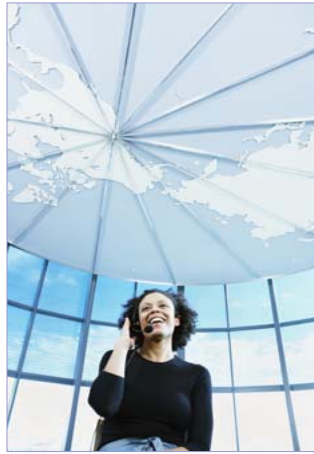
IAAP has members all over the world, even overseas.

Many corporations, educational institutions, students, and international affiliate organizations also belong to IAAP.